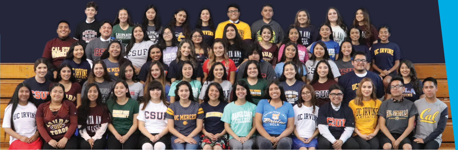
Oh! The places they're going! 2018 College Bound graduating seniors in attendance at the ceremony on Saturday, May 19, at our Santa Ana Club.